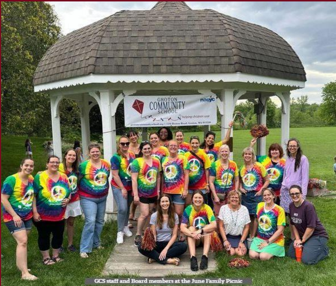
GCS staff and Board members at the June Family Picnic